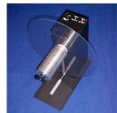
The new UCAT-40