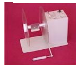
The new UCAT-2