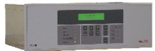
Printer Control Unit PCU III