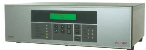
Printer Control Unit PCU III