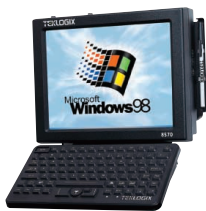
8570 with Optional Keyboard

*Specifications are subject to change without notification.