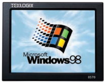
8570 Vehicle-Mount Computer