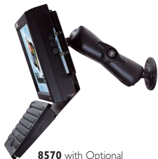
8570 with Optional Mounting and Keyboard