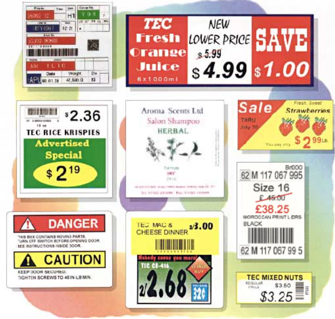
(Labels are sized reduced)

As well as the Windows Drivers the CB-T3 series has the inbuilt TEC Programable Control Language. This allows Color labels and Tags to be printed with most common Barcodes, 2D Symbolologies, Text and Graphics through serial or parallel ports.